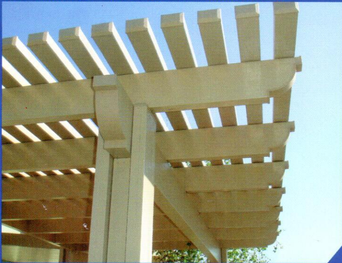
▼ Weatherwood™ lattice cover with Corbel end cuts