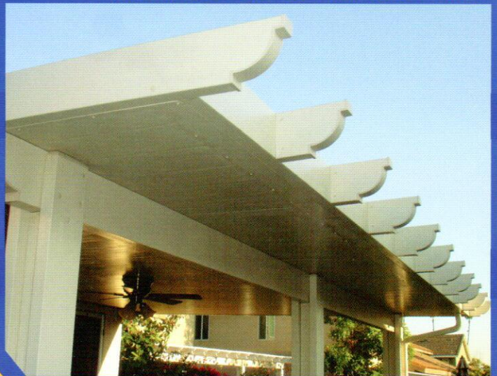
▼ Weatherwood™ solid cover with Corbel end cuts