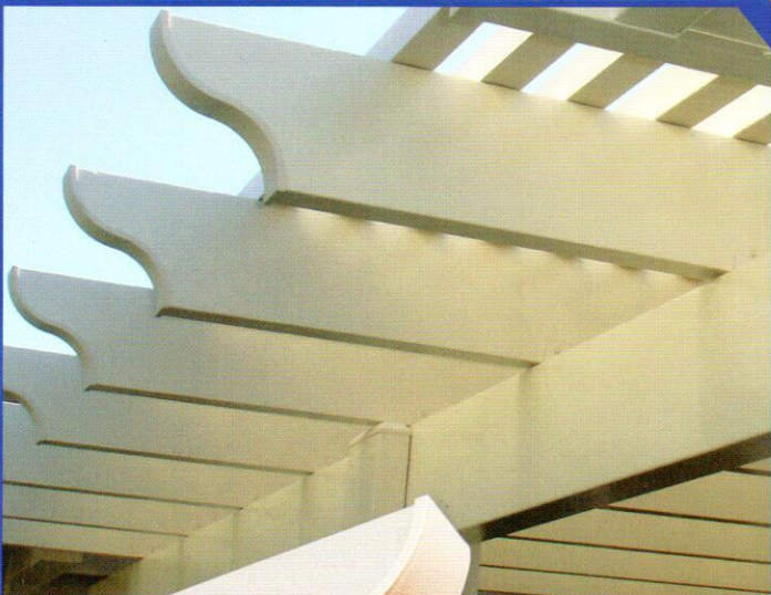
▼ Weatherwood™ lattice cover with Scallop end cuts