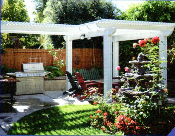
▼ Free-standing lattice cover