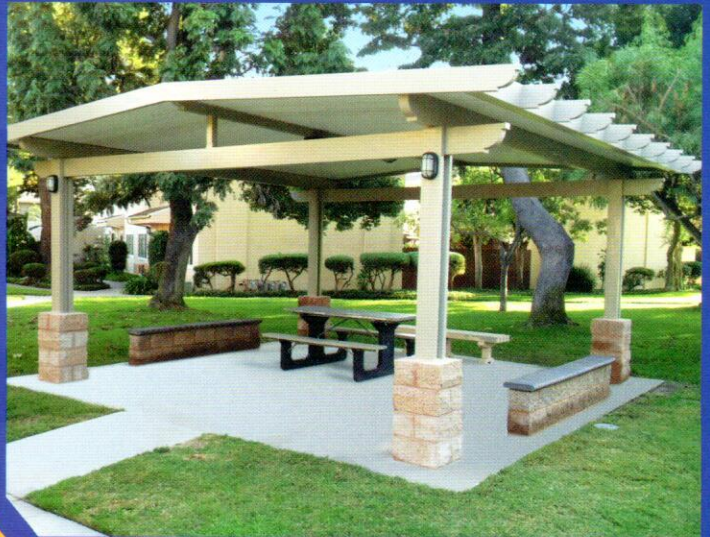
▼ Commercial picnic area cover