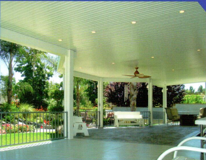
▼ Solid cover with Light Strips™